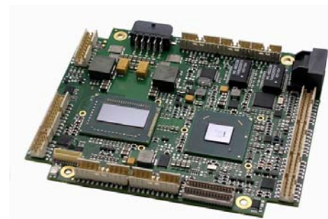
Figure 3: ADLQM67 2655LE Core i7 PCIe/104

Lastly, the PCIe/104 ADLQM67 is also supported with the availability of thermal solutions and system enclosures to meet custom requirements related to fit and function, ruggedizing, or extended temperature specifications.