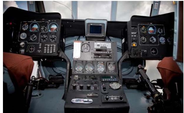
Figure 2: Command and Control Center

I/O capabilities for the ADLQM67 include two Gigabit Ethernet ports which support boot and jumbo framing, two SATA 3.0 ports operating at up to 6Gb/s, eight USB 2.0 ports, and the PCIe bus which can connect to any number of data and video acquisition peripherals such as Mil-Std-1553 communication cards, and video framegrabbers, etc.