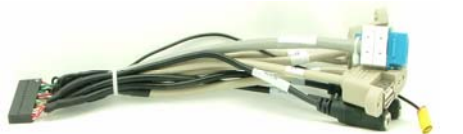
30-Pin Multi I/O(4xUSB, GBLAN, Audio) (10") 100-9641