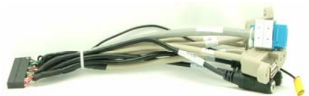
30-Pin Multi I/O(4xUSB, GBLAN, Audio) (10") 100-9641