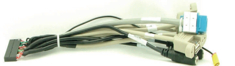
30-Pin Multi I/O(4xUSB, GBLAN, Audio) (10") 100-9641